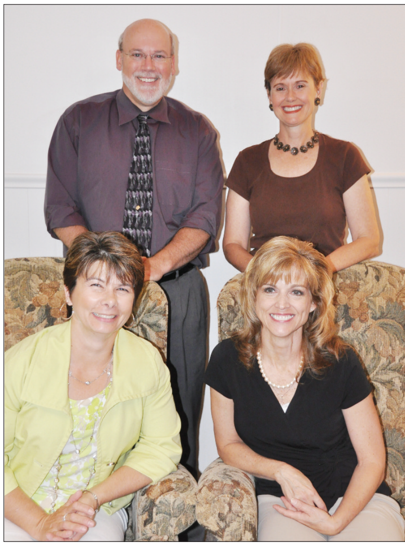
The counselors at Synago.